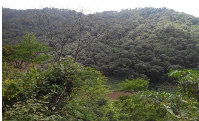
Edging model under the shaded forest