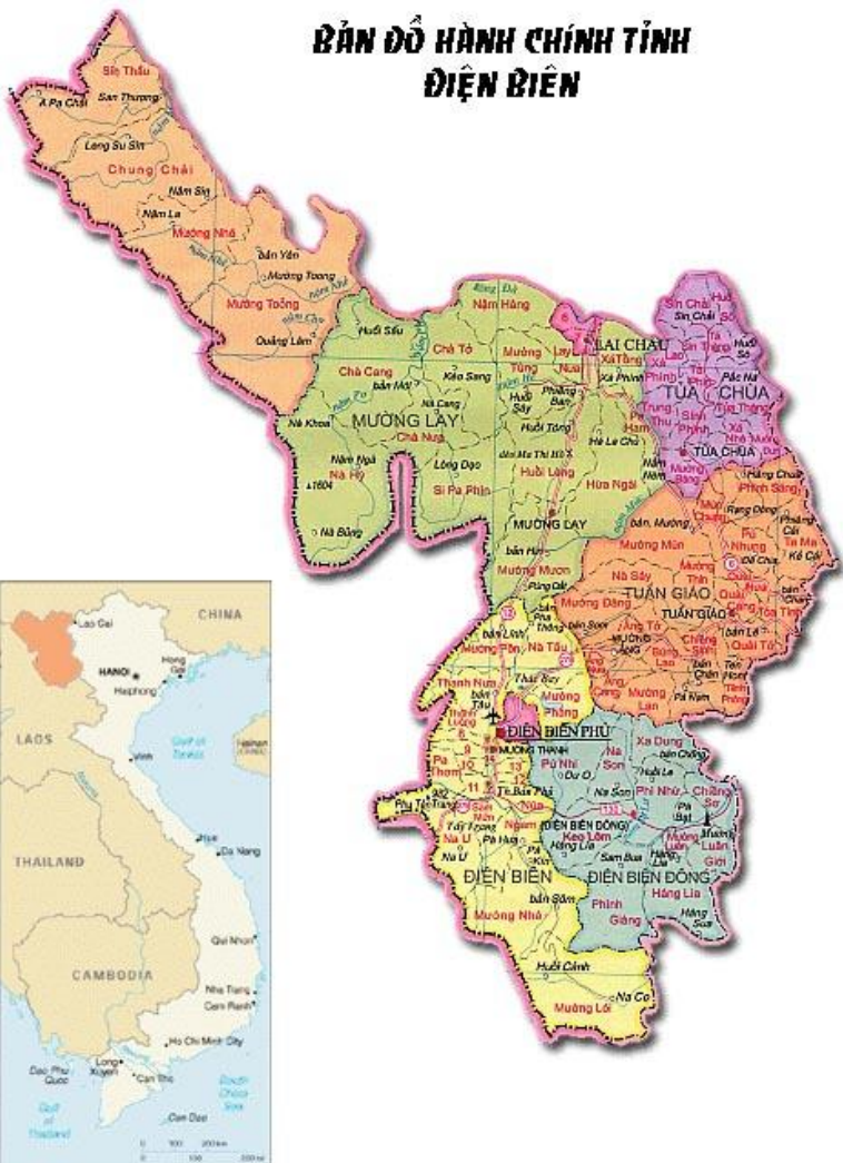
BẢN ĐỒ HÀNH CHÍNH TỈNH DIỆN BIÊN