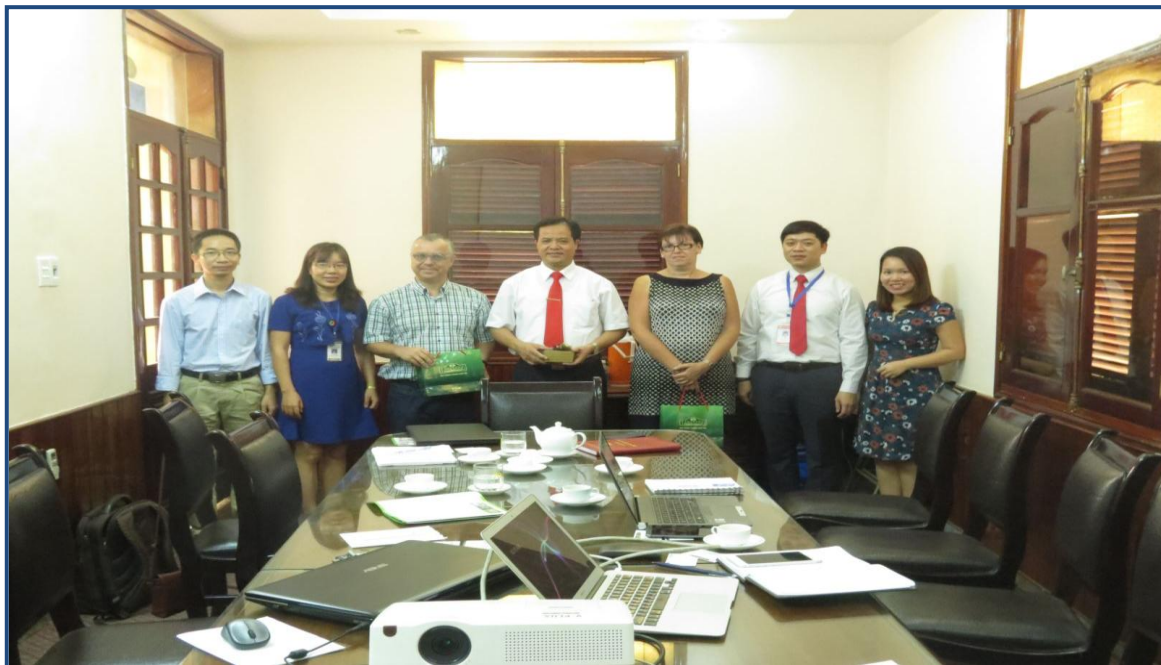
Representatives of both universities discuss about cooperation opportunities