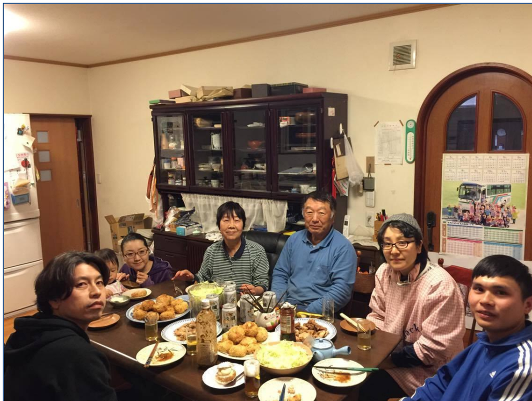
Dinner with my landlord's family

Japanese is a hieroglyphic language, so I had some difficulties when starting to learn it. Although teachers helped me a lot and I tried so hard to learn, but I realized that such an effort was not enough for me to overcome the language barrier when I arrived in Japan. I listened to my landlord carefully and observed how he worked, then took notes every single word and tried to memorize them with actions. When he taught me to do a thing, I did it right away. In the meantime, I had him check if it was right, then went on to do the rest of the work. That was the best way to learn new vocabulary. One month in Japan, I got used to communicating with people and my listening skills were improved a lot. Apart from work, I were able to share and chat more about daily stuff with my landlord.