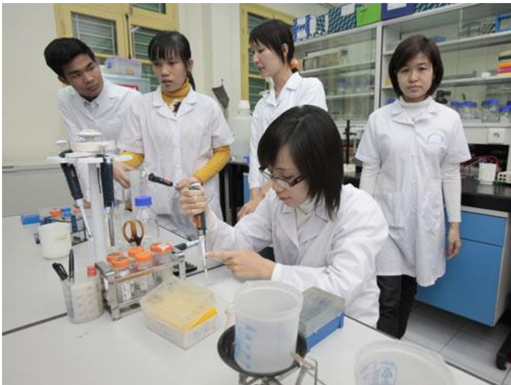
Modern facilities for studying