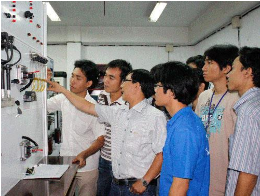
Modern facilities for studying